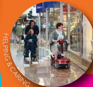
HELPING & CARING