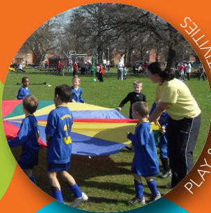
PLAY & SPORT ACTIVITIES